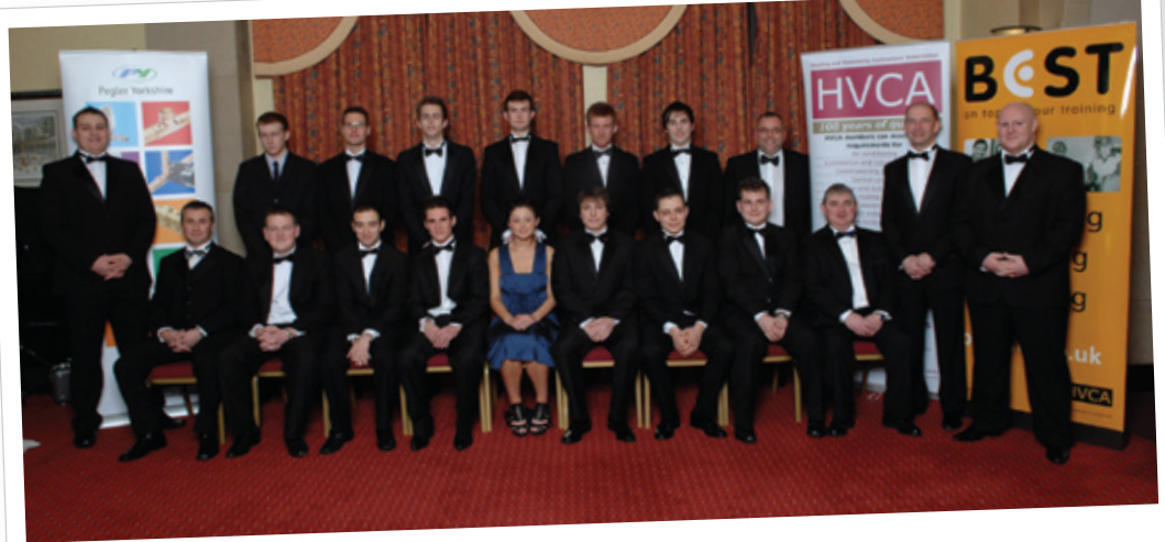
HVCA Training Awards - Staff and Students